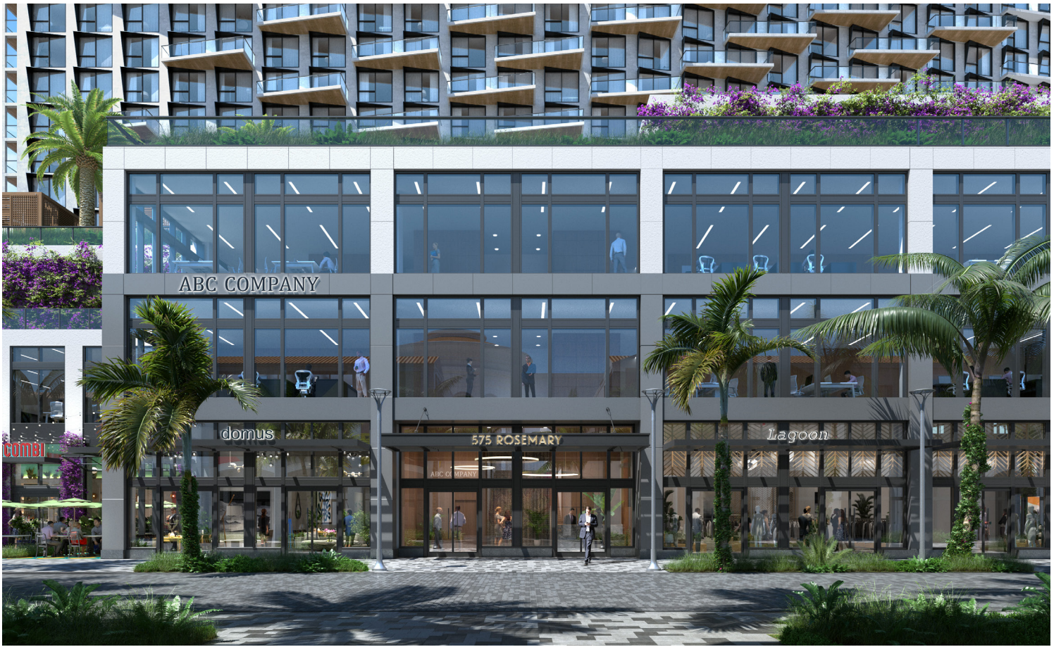
Ground floor lobby with branding opportunity