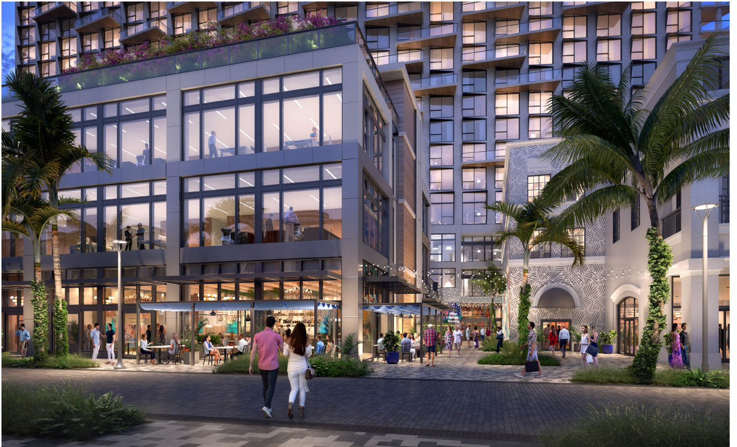
Walkable to a wide array of restaurant offerings